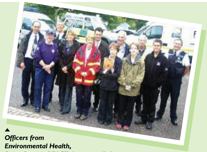
▲ Officers from Environmental Health, StreetScene's REACT, Axminster Police, Community partnership and The Red Cross working together.

A Red Cross representative joined the team to offer a life saving course in the village. Residents were also offered a Police home security check and a fire prevention assessment. An open surgery was held on the same day at the village hall, where an Environmental Health Officer was available all day to discuss local concerns with residents.